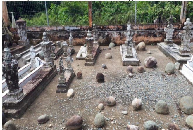
Figure 2: Tomb site of the kings of Trumon