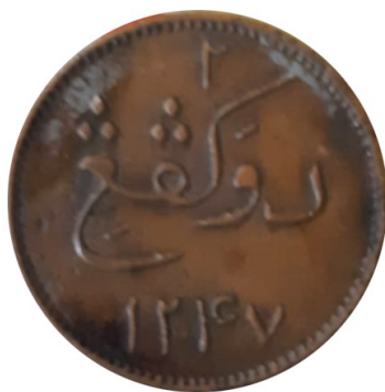
Figure 3a: Front view of Trumon's Kepeng coin

From historical records, ships from the United States (US) began trading on a large scale in the 1780s in the Asian region. The first documented visit by US vessels to Padang and Bengkulu occurred in 1789. Then, in 1795, the ships found a new shipping route to the centre of a large and new black pepper plantation on the southwest coast of Aceh, located between Susoh and Trumon. Aceh then began to establish trade relations with the US, and the US brought its merchant ships to supply black pepper and then exported it to the US, Europe, and China. 41 The Kingdom of Trumon is known to have produced its coins ( Kepeng ) to support its economy (Figure 3a, b). 42 These coins marked Trumon's independence from Aceh's sovereignty and showed considerable economic activity in the region.