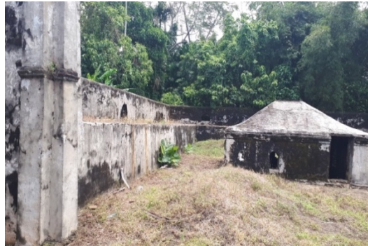
Figure 1: The ruins of the Fort Kuta Tambeh in Trumon