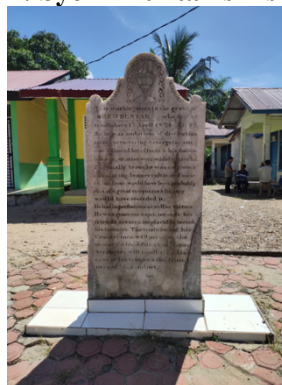
Figure 4: Syekh Buntar’s inscription