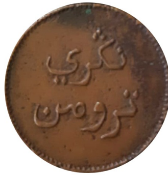
Figure 3b: Back view of the Kepeng coin