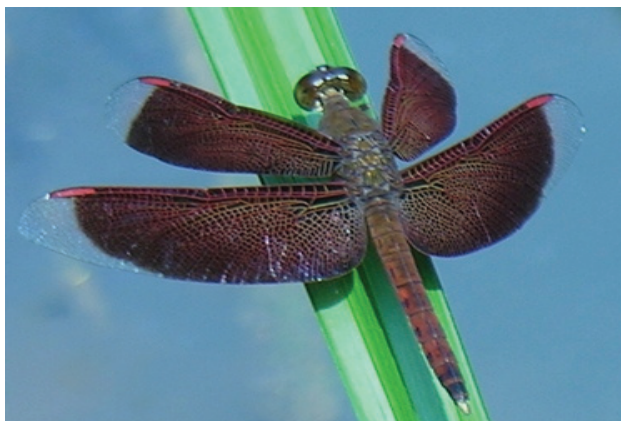
Plate 3. Male Coppertone Velvetwing, Neurothemis fluctuans (Fabricius, 1793) showing clear coppery coloured patched wings with clear wing tips.