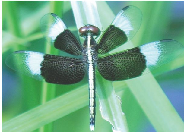
Plate 2. Male Cloudy Velvetwing, Neurothemis tullia tullia (Drury, 1773), showing clearly dimorphic wing patterns with added spread of black wing areas and clear wing tips. Body colours similar as female.