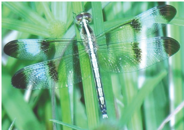
Plate 1. Female Cloudy Velvetwing, Neurothemis tullia tullia (Drury, 1773) showing cloudy patched wings with black adjacent lines and patches of black wing tips.