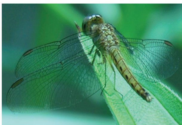
Plate 4. Female Coppertone velvetwing, Neurothemis fluctuans (Fabricius, 1793) showing clear hyaline wings displaying sexual dimorphism.

Morphological dimorphism is an interesting phenomenon among dragonflies as in other insects and animals. Neurothemis (velvetwings) with two congeneric species are distinctive in their colour forms [17, 18]. The females of Neurothemis tullia tullia (Cloudy Velvetwing) have cloudy patched wings (Plate 1) and males have in addition to the cloudy markings, heavily tinted black wings (Plate 2). The males of Neurothemis fluctuans (Coppertone Velvetwings) have equally deep tinted wings with deep copper colour (Plate 3). The female wings are void of colour or markings (Plate 4).